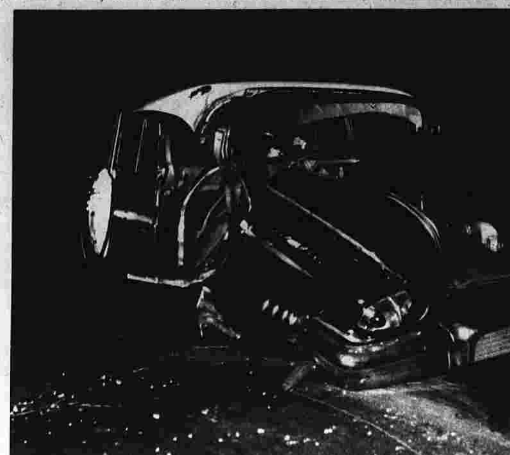
The Randall N. Westfall car shortly after it went off Buckland Rd. this morning. Three persons were injured.

HARTFORD (AP) - State members of the United Auto Workers are balking at paying increased union dues to sub-