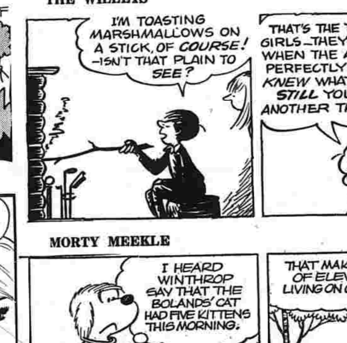
THE WILLETS BY WALT WETTERBERG