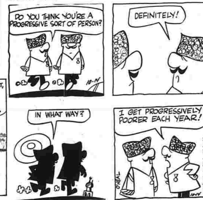
SHORT RIBS BY FRANK ONEAL