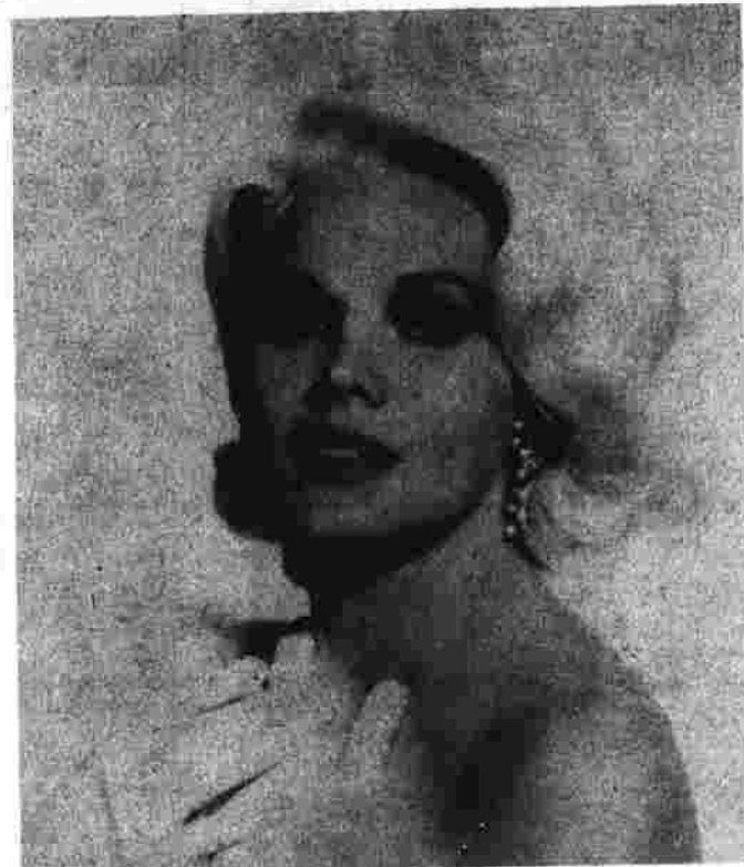
Carroll Baker as Jean Harlow, the motion movies' sex symbol in the '30's, in "Harlow" Sunday, 9 p.m.