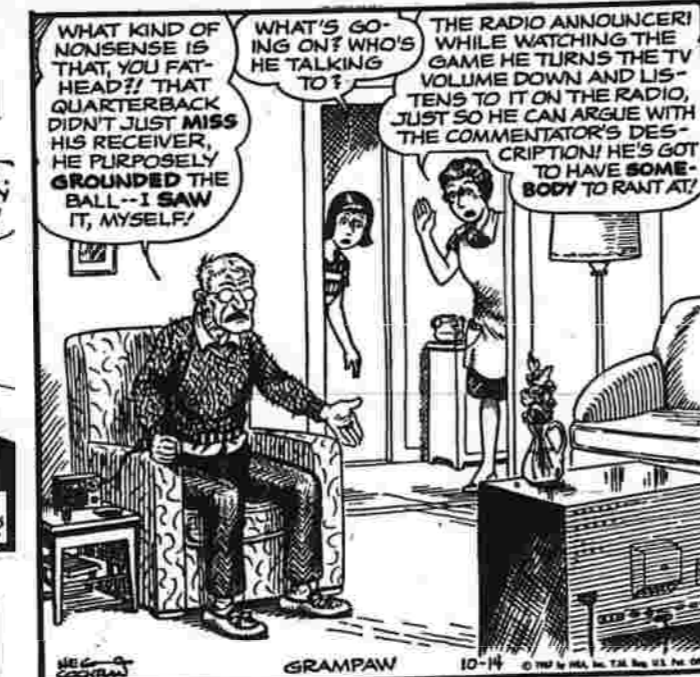
OUT OUR WAY BY J. B. WILLIAMS