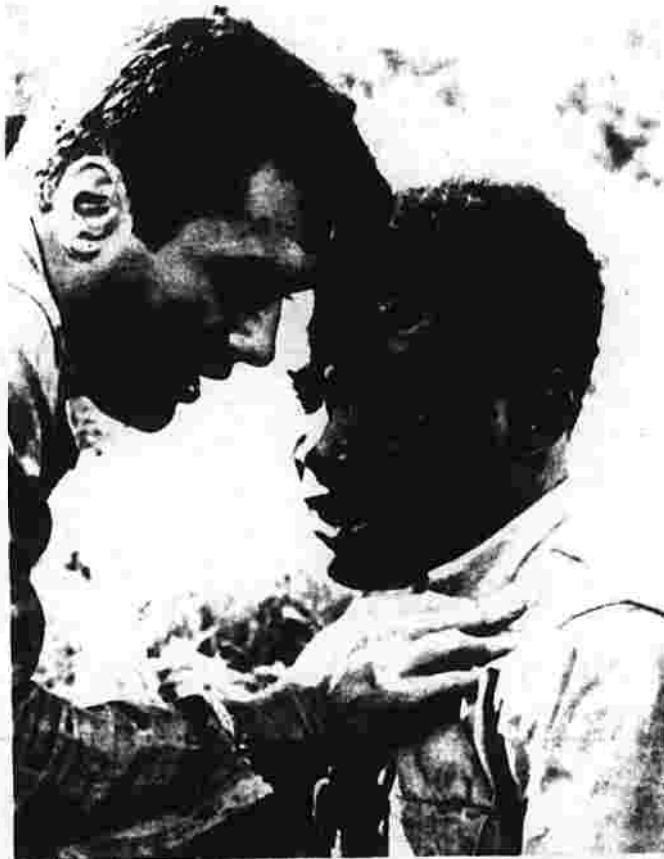
Tony Curtis and Sidney Poitier as they flee a chain gang in "The Defiant Ones" Thursday, 9 p.m.