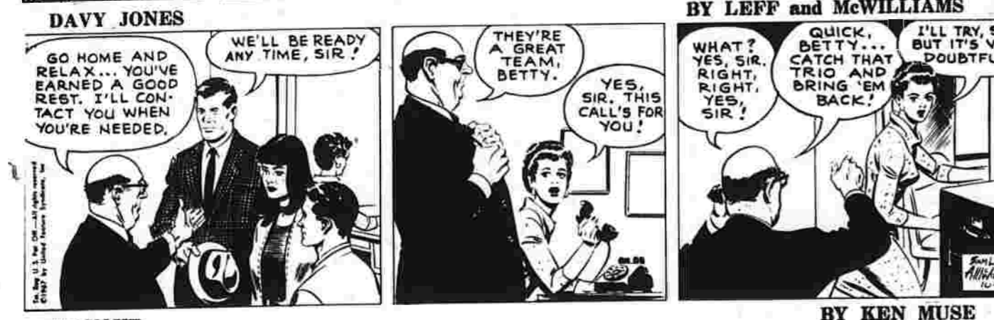
BY LEFF and McWILLIAMS